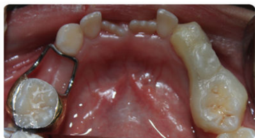
Figure 2. B&L and FRC SMs.

All patients were instructed about following oral hygiene measures, caring for the space maintainers ( Figure 2 ) and returning promptly to the pediatric dentist as soon as conveniently possible in case of any complaint. Parents and children were informed about recall at 1st, 3rd, 6th, and 12th months for evaluation of space maintainers and to continue periodic recall till appliance would eventually be removed. At baseline, oral health was assessed. Assessments at 1st, 3rd, 6th, and 12th months follow up period were accomplished for clinical performance and effect of SMs on oral health, while satisfaction of patient and parent was evaluated 12 months after the fabrication of SMs.