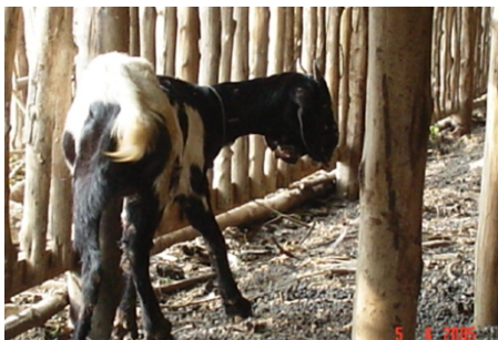
Figure 1: Adapted from theera rukkwamsuk (2007).

Goat housing should be designed with manure handling in mind. Ventilation is an important aspect of animal housing, particularly closed housing. Poor ventilation can be detrimental to animal health