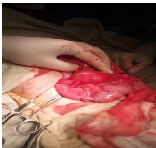
Figure 3: Images of large part of duodenum and the continuing part.