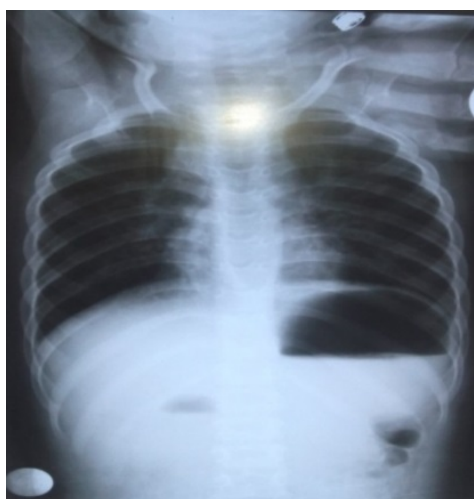
Figure 2: Small hydrolevel giving double bubble image.