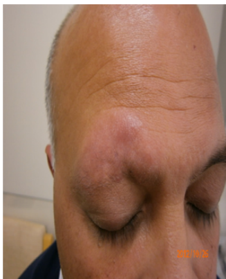
Figure 3: Follicular Mucinosis over the right eyebrow.