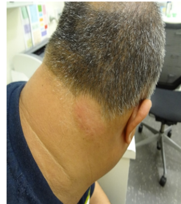
Figure 1: Folliculitis Decalvans over the right posterior neck.

A histology slide from the biopsy of his right eyebrow lesion is shown in Figure 3. Histology showed well developed follicular mucinosis with a moderately heavy inflammatory cell infiltrate. The interstitial infiltrate was heavy and composed of lymphocytes and eosinophils and a few neutrophils, well below the epidermis with no epidermotropism.