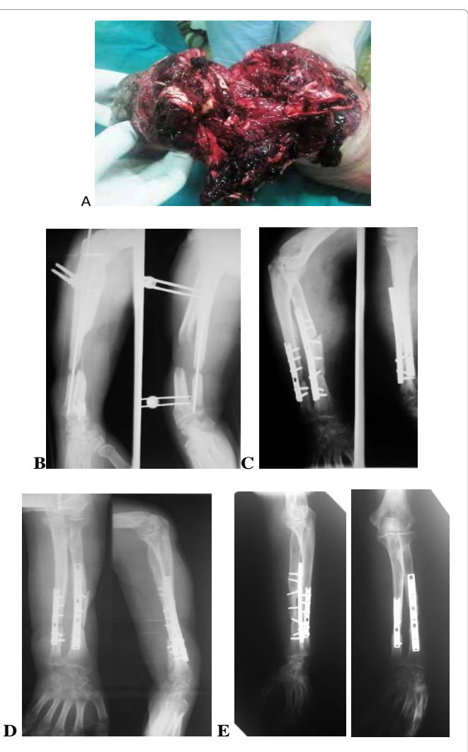
Figure 2: Case 1: A. post-traumatic image of the right forearm (incomplete amputation); B. post-operative X-Ray: fixed forearm bones with a residual 7cm radial shaft defect; C. post-operative X-Ray after FVFG; D. 3 months X-Ray after FVFG, showing callus formation; E. 3-year follow-up X-Ray.