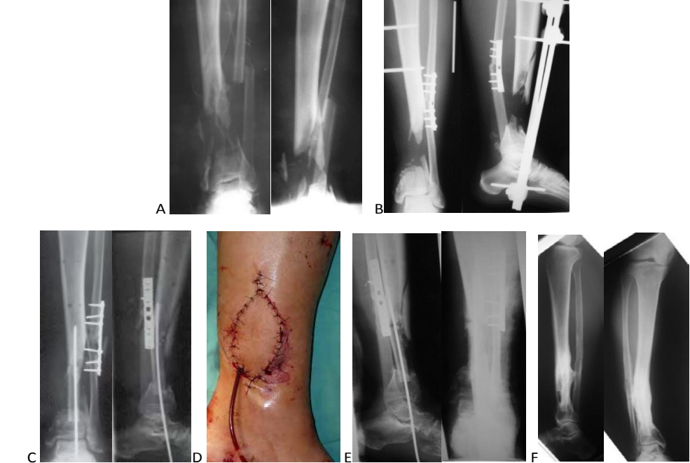
Figure 3: Case 2: A. preoperative X-Ray: 43C3 open fracture; B. post-reduction X-Ray: ORIF of the fibular fracture, where the length of the leg and external fixation of the tibial shaft facture can be observed; C. post-operative X-Ray after FVFG; D. post-operative image after wound closure and skin defect correction; E. 3 month post-operative X-Ray showing signs of callus formation with fibular graft integration; F. 3-year follow-up X-Ray.

The two patients who suffered from high energy trauma were male, as male patients are more exposed to the external environment [15].