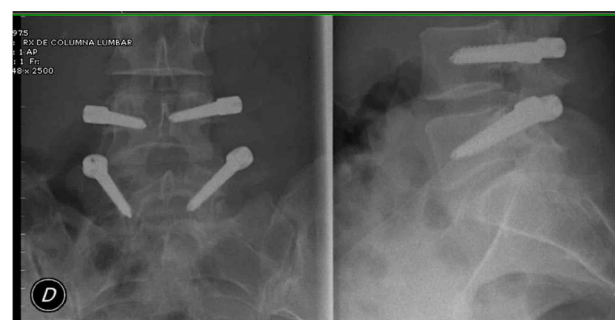
Figure 3: Right L4 screw loosening "Double halo sign" (radiolucent zone surrounded by an outer radiopaque rim of dense bone).

The great variability of the measurement tools found to evaluate the functional outcomes makes impossible to compare the studies. Even those documents which used the same measurement tool, the way to express the result was different. There were authors who expressed improvement by the change of the mean score, while other authors showed the results in percentage of patients who improved. Some documents, assessed functional results only after surgery, without