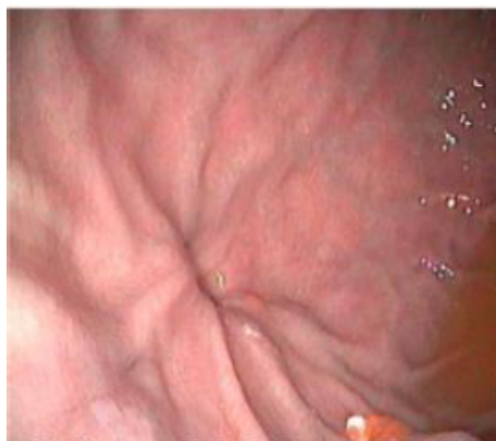
Figure 3: Endoscopic image of gastric fundus and mouth of the diverticulum.

In the case of an asymptomatic gastric diverticulum there is no specific treatment, it is related to the degree of symptoms of the patient has and could be attributed to the diverticulum. PPI therapy for a few weeks can resolve symptoms in some cases, however in some patient's symptoms such as dyspepsia and epigastric pain will be refractory to inhibition of acid secretion [4]. Surgical treatment is recommended for long, symptomatic diverticula and complicated with perforation, bleeding or suspected of malignancy, laparoscopic and open resection has been successful [5]. Surgical treatment of gastric diverticulum through laparoscopy was described since 1998 with excellent results (Figures 3 and 4) [6,7].