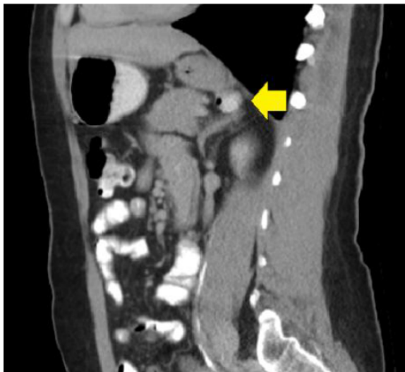
Figure 2: CT-scan-sagittal section observing diverticulum on the posterior wall of the stomach containing contrast medium and air.