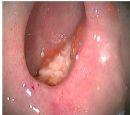
Figure 4: Endoscopic image of the diverticulum with remains of food inside.