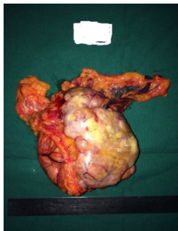
Figure 2: Gross picture of the tumour.

Intraoperative clinicopathological discussion was done. Although a primary omental GIST was still a possibility, the bulky uterus with multiple fibroids, 2 of them which were exophytic yellowish and adherent to the omentum gave the possibility of a primary mesenchymal tumour with omental metastasis. Since all other organs were normal and no other primary lesion could be made out, total abdominal hysterectomy and omentectomy was done.