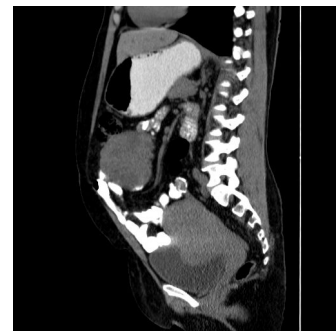
Figure 1: CT scan of the abdomen.

CT scan of the abdomen was done with contrast to further delineate the lesion. This showed 10 cm lobulated lesion in the abdomen possibly in the mesentery and splaying the small bowel. Clinicoradiologically, possibility of GIST from the small bowel was thought (Figure 1).