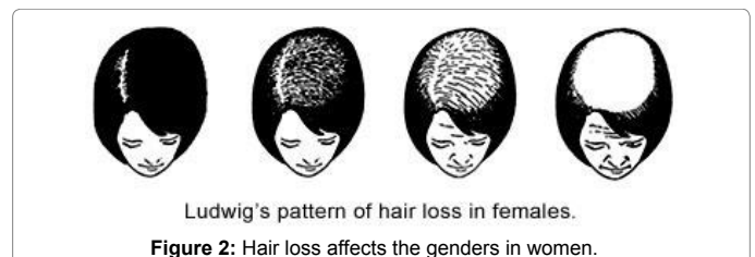
Figure 2: Hair loss affects the genders in women.