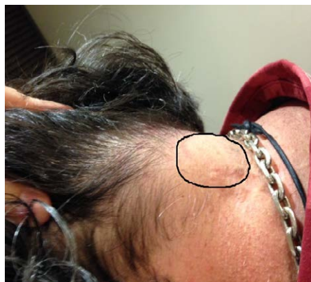
Figure 2: Subcutaneous mass in left occipital and upper cervical regions.

cephalalgias (TAC) like headaches are reported more commonly due to intracranial abnormalities such as vascular malformations, benign and malignant tumors followed by MS, head trauma and infectious diseases [1-5] than extracranial lesions (cervical meningioma, nasopharyngeal carcinoma, syringomyelia, etc). Moreover, the extracranial abnormalities described as responsible for cluster headaches (CH) and cluster-like headaches are not limited in their location and nature, and may stem from vascular and neoplastic lesions to infectious and traumatic ones in various regions of the head and the neck [6].