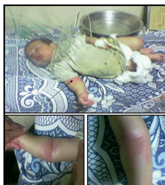
Figure 2: Widespread redness and swelling at the injection site of the right antecubital region regarding the studied case.

The baby was discharged from the PICU on the 4 th day and from the hospital on 6 th day without any sequelae. Further evaluation of the baby 2 weeks later showed normal clinical findings and the PCE values were within the normal range.