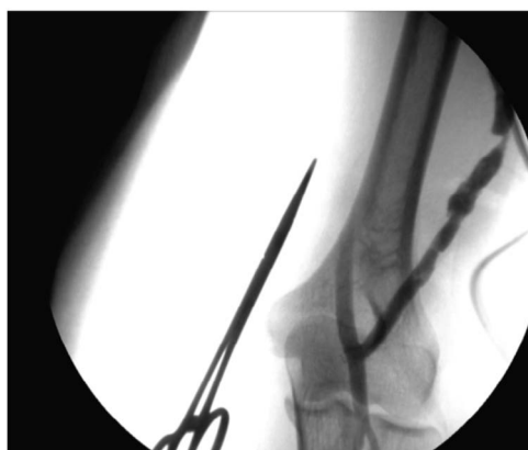
Figure 2: Axillary vein stenosis after thrombectomy.