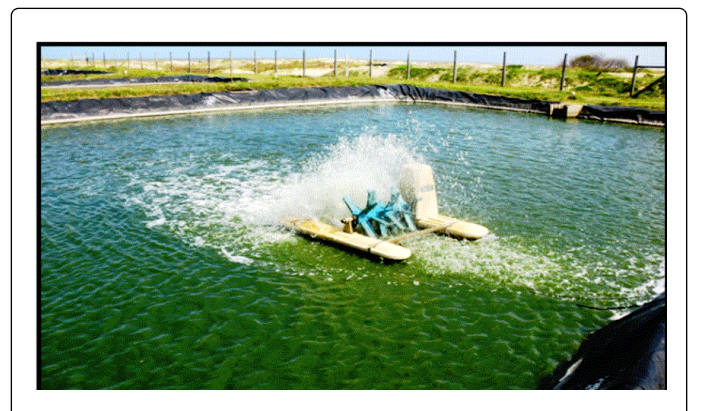
Figure 1: Open shrimp tanks next to the shoreline at the Cassino beach where EMA is located. Intense blue-green color of cyanobacterial blooms in the water.

Early registration of scum, or colored waters, consistent with cyanobacterial blooms refer back to at least 1853. In a perceptive and prescient paper in Nature, the Adelaide assayer and chemist George Francis reported on stock deaths at Milang on the shores of Lake Alexandrina in South Australia. Francis attributed the deaths to the ingestion and toxicity of scums of the cyanobacterium Nodularia spumigena [1].