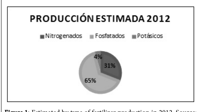
Figure 1: Estimated by type of fertilizer production in 2012.

According to own calculations, based on data from the National Association of Chemical Industry (ANIQ), in 2012 increased the proportion of phosphate fertilizers with respect to the total production in Mexico, the figure reached 65%, and decreased nitrogen with 31% and 4% potassium (Figure 1).