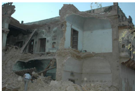
Figure 2: Team visited after explosion and able to solve the happening on the basis of residual parts.

An incident of explosion was reported while labourers were working in an old fortress with an electrical arc welding machine on the door of a room of fortress (Figure 2). The incident took the life of two persons while two others got seriously injured.