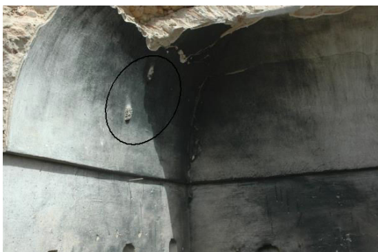
Figure 3: Remaining part of the building, as shown in figure with black circle welding material, some smouldering hot metal or welding mixture was found.

Three psi pressure excess to atmospheric pressure results into the value 1.2 atmospheric pressure on conversion. To generate this pressure inside the room volume of gas required is pressure multiplied by the volume of room in cubic feet. Hence the required amount of gas should be either blown in abruptly inside the room or generated inside the room. One gram of black powder yields 718 cal of heat, 270 cc of permanent gas, and roughly a half-gram of solid residues, proving that transformation is inefficient compared to smokeless powder [4]. By applying basic physics and chemistry of the explosion we have first ever estimated the amount of the Gun Powder present at the time of explosion in that affected room. The simple mathematical estimation of total consumed Gun Powder is as detailed below: