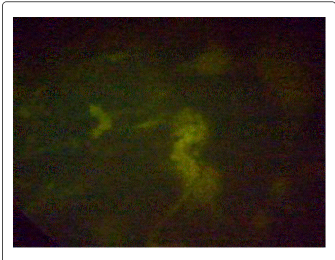
Figure 4: Negative control slide showing no immunofluorescence