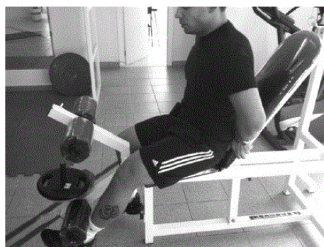
Figure 1: Exercise without vascular occlusion

Athletes from group 1 were positioned seated on a leg extension, with their knees flexed at 90°. The exercise was performed isotonicly in knee extension, distal resistance was provided by a distal weight, utilizing two sets of 30 repetitions with an interval of 30 seconds between each repetition [2].