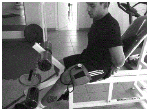
Figure 2: Exercise with vascular occlusion