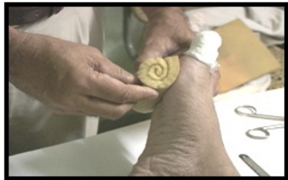
Figure 9: Placing samadhan unit on plantar surface.