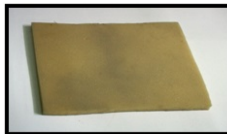
Figure 4: Piece of foam measuring 6 inches × 4 inches is cut from the big sheet.

It is very simple to manufacture and we recommend that healthcare providers can have a Samadhan manufacturing Unit in their own clinic, which might be called “Samadhan Lab”. It needs only a small space to accommodate a small table with a shelf to keep raw material and prepared Samadhan Units. Items required in the Samadhan Lab for manufacturing a Samadhan Unit include a sheet of rubberized foam (density 40), a saw blade, liquid adhesive, sealing wax and a pair of scissors. A piece of foam measuring 6 inches × 4 inches is cut from the big sheet (Figure 4). Adhesive is applied on one side of the foam piece with some metallic applicator (Figure 5), since it is corrosive.