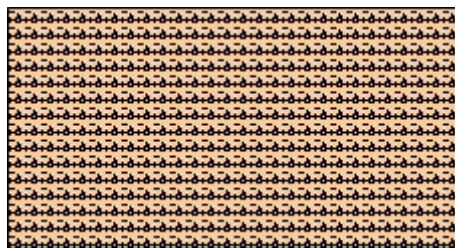
Figure 2: Retainer: a piece of elastocrepe bandage.