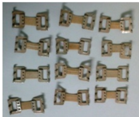
Figure 3: Fastners: metallic hooks provided with the elastocrepe bandage or safety pins.

It is very simple to manufacture and we recommend that healthcare providers can have a Samadhan manufacturing Unit in their own clinic, which might be called “Samadhan Lab”. It needs only a small space to accommodate a small table with a shelf to keep raw material and prepared Samadhan Units. Items required in the Samadhan Lab for manufacturing a Samadhan Unit include a sheet of rubberized foam (density 40), a saw blade, liquid adhesive, sealing wax and a pair of scissors. A piece of foam measuring 6 inches × 4 inches is cut from the big sheet (Figure 4). Adhesive is applied on one side of the foam piece with some metallic applicator (Figure 5), since it is corrosive.