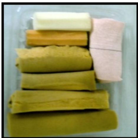
Figure 7: Pile of samadhan units and retainer bandage.

After wrapping the retainer bandage, patient may go for his work, wearing a velcro sandals (Figure 11).