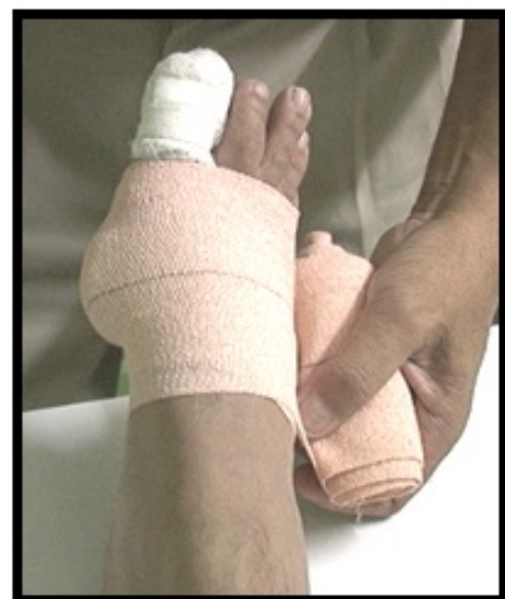
Figure 10: Wrapping retainer bandage.