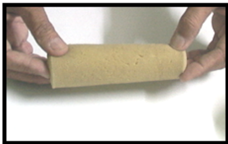
Figure 1: Samadhan unit: a foam cylinder.

Samadhan System has 3 components [24] (Figures 1-3).