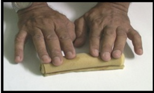
Figure 6: Rolling in to a cylinder.

We apply with the saw blade. Then carefully, saving skin of finger tips, we roll up the foam piece into a cylinder (Figure 6) and put some weight on this cylinder to allow adhesive to dry up.