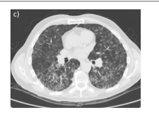
Figure 1c: CT chest following course of intravenous and six week oral corticosteroid taper showing improvement to interstitial disease.

progression. He declined further treatment and pursued alternative therapy.