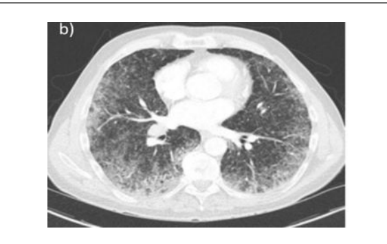
Figure 1b: CT chest at presentation showing subpleural reticular changes.

One week after the first dose, he presented to hospital with a dry cough, worsening dyspnoea over the last week and oxygen desaturation to 84%. The patient was afebrile, inflammatory markers were not raised and respiratory serology was unremarkable. A CT chest done during this admission (Figure 1b) showed an interstitial pattern of lung disease characterised by extensive subpleural reticular changes, most marked at lung bases and diffuse widespread centrilobular nodules. When compared to the baseline CT scan (Figure 1a), there was increased nodular opacities and worsening of the pre-existing ground-glass opacities in the lower lobes bilaterally. Bronchoscopy identified endobronchial melanoma metastases that were cauterised. Transbrochial biopsy was attempted that did not confirm sarcoidosis or melanoma but contained multiple reactive cells. Serum ACE levels were normal.