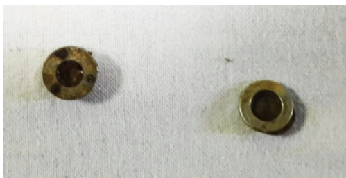
Figure 3: Retrieved two magnetic foreign body.

much difficulty and evacuate usually in a few days to weeks [1,2]. 10-20% cases require endoscopic removal [1]. Surgical removal of foreign body is rarely required [1,3]. Ingestion of single magnetic foreign body usually does not produce any complication because like other foreign body it would likely to get spontaneously evacuated but if children has ingested multiple magnet or magnet with other metallic foreign body then it impose risk of severe gastrointestinal complication. Small bowel has relatively thin wall so attraction of multiple magnets towards each other across the bowel loops lead to pressure ischemia and necrosis of bowel wall and development of various complication like obstruction, perforation, volvulus and intraperitoneal hemorrhage due eroding of mesenteric vessel [1,3,4-6]. Absence of free air in Plain abdominal radiography may be explained by fact that these produce local peritoneal reaction and inflammation [4].