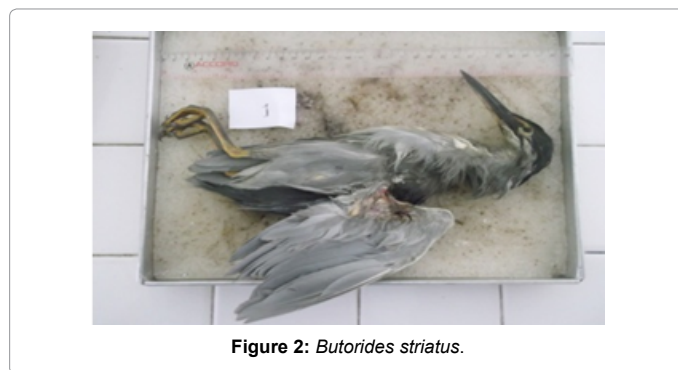
Figure 2: Butorides striatus .