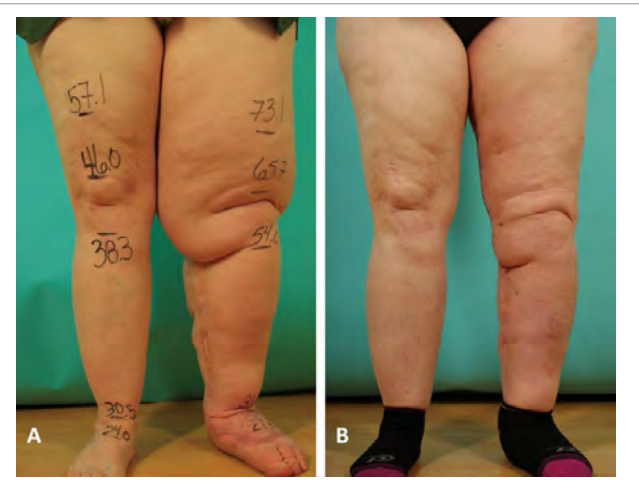
Figure 1A: Campisi stage V lymphedema of left lower extremity.

The current strategy in lymphedema treatment is to selectively treat patients with fluid-predominant disease with a drainage procedure such as LVA and VLNT, and those with solid-predominant disease with a debulking procedure such as liposuction and the Charles procedure [4]. In practice, however, few patients can be unequivocally categorized into either disease category. Most demonstrate a mixture of both fluid and solid disease components. Mandatory disease categorization and treating the patients with either drainage or debulking procedure results