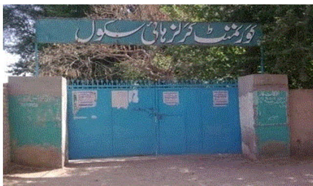
Figure 6: Government Girls High School, Dinga, District Gujrat received threat pamphlets from ISIS to close down or be prepared to be blown up.

Again national dailies of 7th January 2016 carried another news item on the front page that said: "Government Girls High School Dinga receives a threat letter from ISIS". The news report said that District Coordination Officer and the Police was conducting an investigation whether the threat letter was from ISIS or someone had done so just for fun and to create a panic in the area 28 .