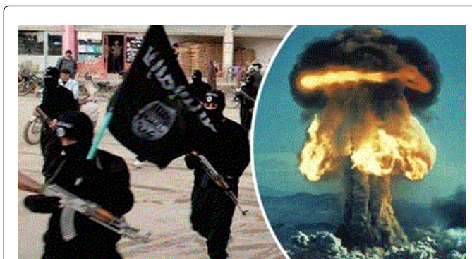
Figure 3: ISIS Recruits in Baluchistan Province of Pakistan on the right, the picture shows atomic blast by Pakistan in Chaghi, Baluchistan on 28th May, 1998.