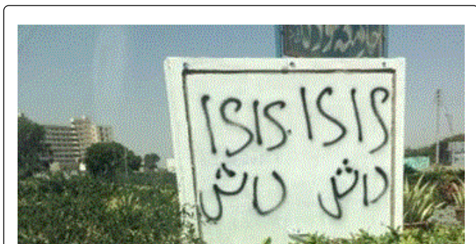
Figure 1: ISIS Wall chalking and posters displayed in Karachi.

dignity, modesty and honour of women and do not believe in human rights of anyone except for themselves? (Figure 1).