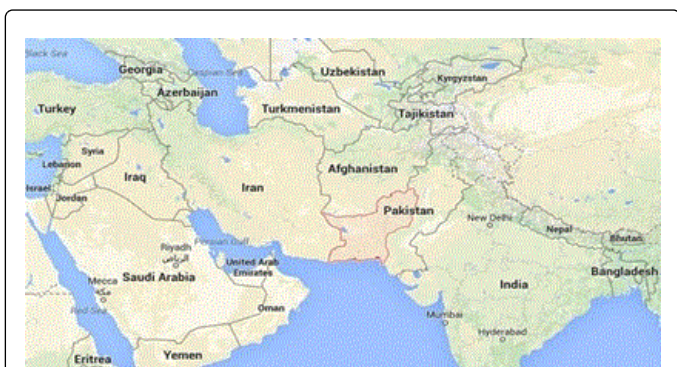
Figure 5: The map shows Baluchistan, the largest province of Pakistan which is said to be one of the centres of activities of ISIS.