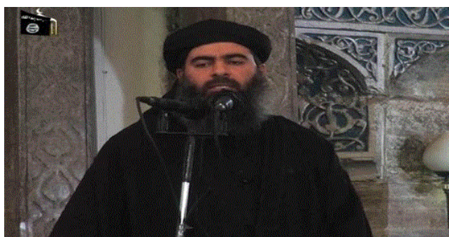
Figure 2: ISIS Chief Abu Bakr Al-Baghdari, the self-declared Caliph of the Islamic World.