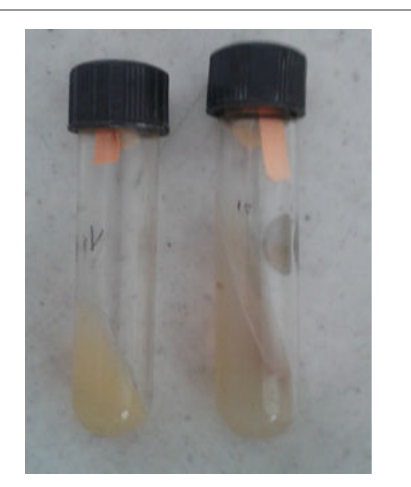
Figure 4: Isolates showing production of HCN gas.