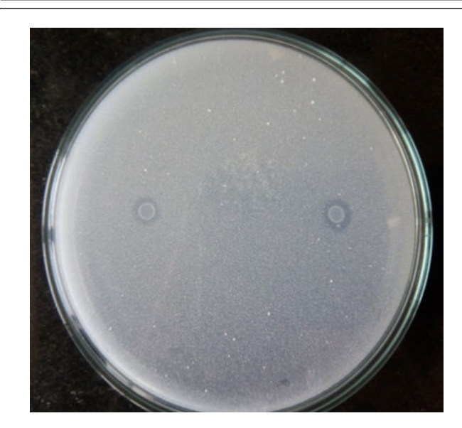
Figure 2: Isolates showing phosphate mobilization.

Figure 1: Growth of organisms after their enrichment on 10% Nutrient Agar.