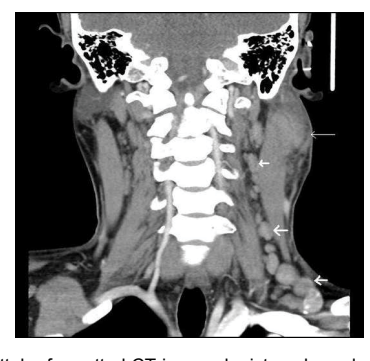
Figure 3: A sagittal reformatted CT image depicts enlarged enhancing cervical lymph nodes from levels II-V of the neck on left side. The left parotid mass lesion is also well seen.

*Corresponding author: Tarun Mohan Mirpuri, Singapore General Hospital, Singapore, Tel: +65 6222 3322; E-mail: tarun.mohan.mirpuri@singhealth.com.sg