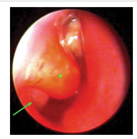
Figure 1: Endoscopic examination showing a bluish cystic mass beneath inferior turbinate (The arrow indicates the mucocele, * indicates middle turbinate).

In the neonatology and pediatric oncology consultation, a 6F feeding tube could be passed through both nostrils. Mild tachypnea, noisy breathing and cyanosis while feeding were noted. There was no other pathological