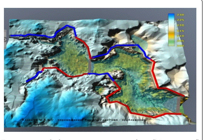
Figure 2: Calculation-monitoring complex "TCR-Prognoz" (evaluating filtration between bypass channels and TCR reservoirs).

Thereafter, for the first time ever TCR was granted the status of a nuclear facility. Acceptable limits for radionuclide discharges from TCR into the environment were set for this nuclear facility based on a specially developed technique which was also a novel practice for Russian nuclear industry.