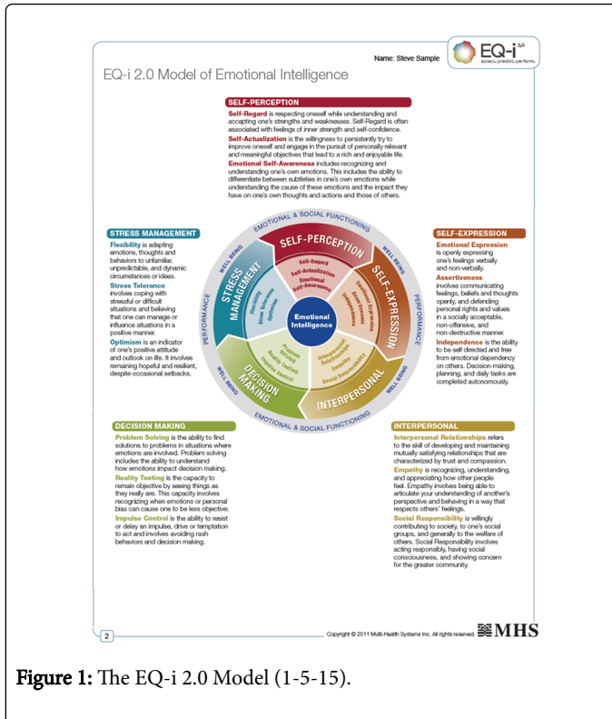
Figure 1: The EQ-i 2.0 Model (1-5-15).

Emotional Quotient (EQ) is how one measures Emotional Intelligence. Mayer et al. [4] state in development of the EQ-i 2.0 model, EI had been defined as a set of emotional and social skills influencing what is perceived and expressed in ourselves. The model outlined below in Figure 1, depicts EI at the core or centre of the