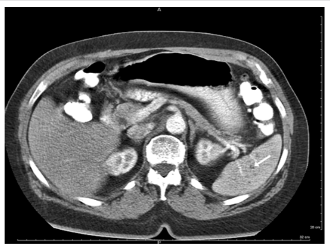
Figure 1: CT scan with multiple hypoattenuating splenic lesions (white arrow).

A 67 year old patient was diagnosed with grade I extranodal follicular lymphoma of the parotid gland. She suffered from a painless swelling of the right parotid gland. No other symptoms, especially no B-symptoms were present on admission. The physical examination as well as the laboratory study was all normal. Histological, immunhistochemical and molecular genetic workup of the parotid gland showed an infiltration by a population of small CD20- and CD10-positive clonal B-cells, consistent with an extranodal follicular Non Hodgkin Lymphoma (FL), grade I. The staging examinations (CAT scan, bone marrow trephine)