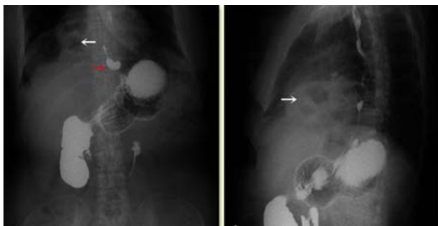
Figure 1: Upper gastrointestinal barium examination, the red arrow indicates a small hiatal hernia; the white arrow indicates a large air-liquid in the bottom of the right lung.

Chest pain and shortness of breath are a common coronary heart disease chief complaint. The differentiation of cardiac versus noncardiac chest pain can be an especially difficult thing when patients present with symptoms of CAD [3]. Acute chest pain could be secondary to spontaneous gastric mesenteric vessel rupture due to a non-strangulated hiatal hernia [4]. The patient's chief complaint was CAD. The initial portable barium-contrast revealed a diaphragmatic hernia. The CT chest show a rare diagnosis of CAD secondary to right hepatic flexure and partial gastric tissue herniated into the chest. The patient had normal coronary artery. The large hernial sac may exert