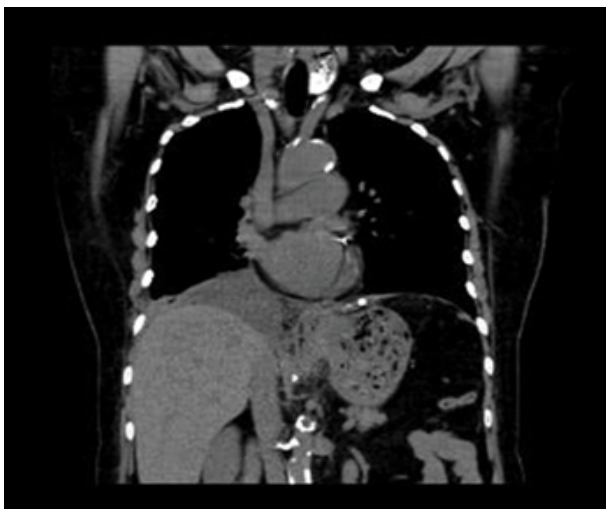
Figure 4: Chest CT, diaphragmatic hernia disappears and diaphragm is intact.

pressure on the surrounding tissues in the chest and lead to recurrent pneumonia, atelectasis, and compression of the heart [5,6]. These may be the cause of long-term obstructive symptoms in this patient.