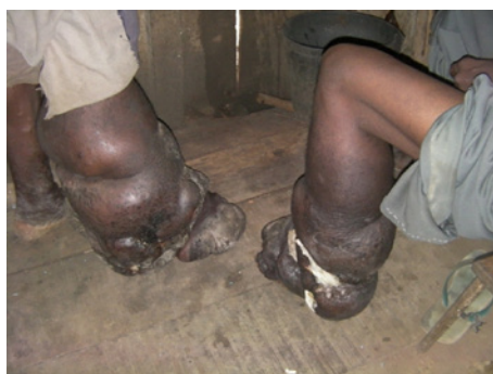
Figure 1: Elephantiasis in lower extremities of right and left legs in twin brothers, respectively.