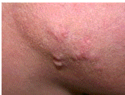
Figure 4: Hypertrophic and keloidal scars (lumpy and thick scars).