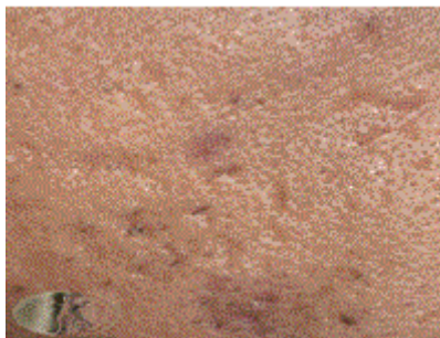
Figure 2: Rolling scars (broad sloping edges).