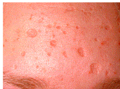
Figure 1: Boxscars (broad sunken-ness with sharply defined edges).

Ultimately the challenge is true acne scars never completely fade, although they visibly improve as time passes. The good thing is, they can be concealed. Patient skin type is also an important factor. Skin type can be classified from Fitzpatrick 1 to 6. Darker skin types have a higher risk of post inflammatory hyperpigmentation. Hence they benefit more from fractional laser compared to traditional full ablative lasers. Scars can occur anywhere on the body, although the upper chest and shoulders are especially prone to them. This is due to poorer regeneration capability, from the lower density of adnexa structures (sebaceous glands, hair follicles).