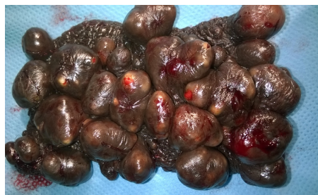
Figure 3: Resected specimen.

The closure of the scrotum is carried out using an overedge stitches of 2/0 vicryl with no scrotal drainage. Histopathological examination of the surgical specimen revealed under scrotal acanthosis the presence of intradermal calcium dystrophic lesions of varying sizes lined with epithelial and connective tissues (Figure 4).