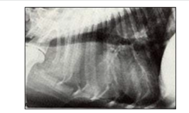
Figure 1: Thoracic Radiograph showing mediastinal mass.