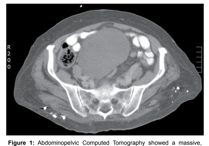
solid, heterogeneous pelvic Computed Tomography showed a massive, solid, heterogeneous pelvic mass (138 mm).

The chest radiograph showed a right-sided pleural effusion. The patient was submitted to pleural drainage yielded 1.500 mL of serofibrinous fluid and referenced to Pulmonology service. At the first visit we documented recurrence of the pleural effusion and the patient complained about a discomfort in the lower abdomen and abdominal distention. On physical examination she had a distended abdomen with dullness in percussion and a positive shifting dullness, with a firm and immobile pelvic mass. It was performed another thoracocentesis and a pleural biopsy that revealed non-specific fibrinous pleurisy. Gram stain and acid fast stains also were reported as negative. Abdominopelvic computed tomography (CT; Figure 1) showed a massive, solid, heterogeneous pelvic mass (138 mm), adjacent to the body and fundus of the uterus and the left ovary and a small amount of intra-abdominal fluid. Images obtained through the lung bases revealed right pleural effusion. In laboratory investigations, CA 125 level 287 IU/mL (normal <35.0 U/ML). The abdominopelvic magnetic resonance (MRI; Figure