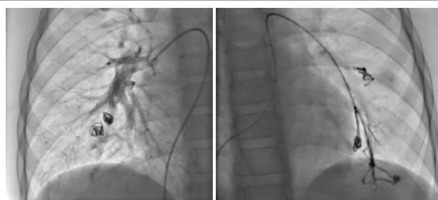
Figure 3: Angiogram of case 2 after embolization, demonstrating multiple pulmonary arteriovenous fistulas in the lower lobes of the left and right lungs occluded with a coil.

(80 mg/d), and a second angiographic procedure was scheduled for the following month for the embolization of the PAVFs in the right lung. During the second angiography, a left pulmonary injection showed the complete occlusion of the left PAVFs with the coil. We occluded the PAVF in the middle lobe of the right lung with 1 steel coil (9 mm × 6 mm). The follow-up visits in the upcoming weeks showed the resolution of the patient's symptoms.