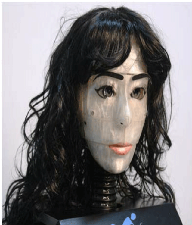
Figure 2: latest version of our lady robot ISRA for a photograph.

Time is not far away that we should respect and accept the rights of a robot as a social being. I think I should not get surprised one day if we find ISRA missing from our front office!