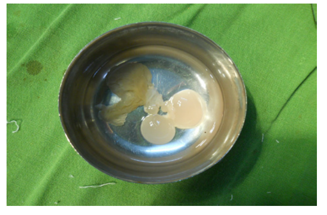
Figure 2: Gross picture of translucent cystic structures in cysticercosis.