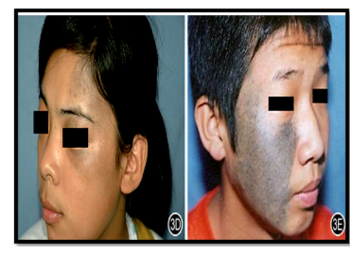
Figure 3: Special manifestations are not in line with Tanino's classification. 3A: Innervation areas of frontal nerve, lacrimal nerve;