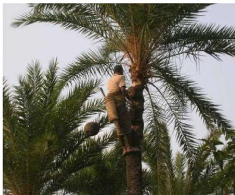
Figure 2: Date palm sap harvesters, known as gachis in Bangladesh.

While the outbreak in Malaysia had progressed from the natural host (fruit bats), to amplification host (livestock) and finally to humans, in Bangladesh no amplification host was needed. People were somehow being directly infected by fruit bats. In the Bangladesh and India outbreaks, consumption of fruits or fruit products (e.g. raw date palm sap) contaminated with urine or saliva from infected fruit bats