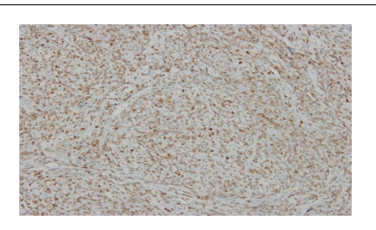
Figure 3: CD3 epsilon 200.

The positive rate of Ki67 was 40%. In situ hybridization(ISH) revealed positive nuclear staining of EBER 1/2 in the lymphocyte-like cells (Figure 4).