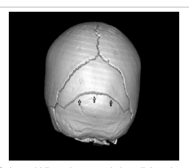
Figure 2: 3D CT showed bilateral symmetric interdigitated patern of mendosal suture (arrows).