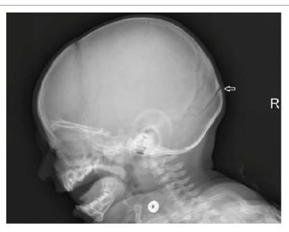
Figure 1: A plain lateral radiograph showed a sharp lucency in right parietal bone (red arrow) representing a calvarial fracture and an occipital lucency that was mistaken for a fracture (white arrow).

A 8 month old boy presented with soft tissue swelling after a