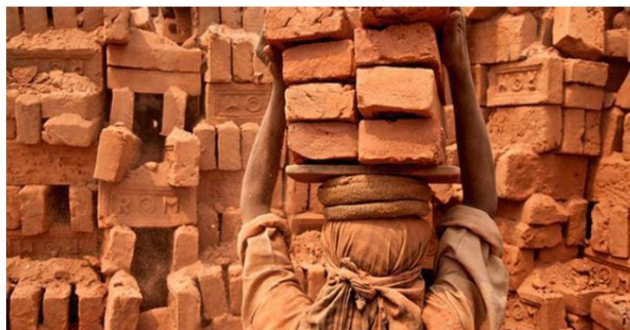
Figure 4: Brick kiln worker in Kathmandu valley transporting bricks. Photo credit: Lisa Kristine [10].

kilograms. Children are also hired on as brick transporters and have been witnessed carry loads heavier than their own weight [14].