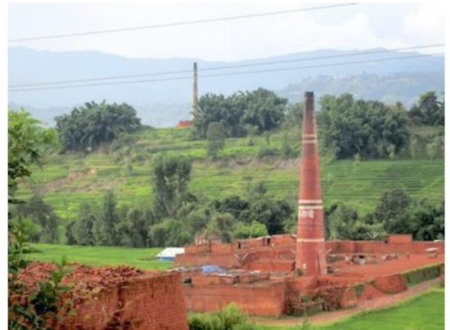
Figure 1: Brick Kiln in Kathmandu Valley, Nepal. Photo by: Sushil Thapa [7].

While the rise in the brick industry has brought more work opportunities to Kathmandu Valley, it has also become one of the top contributors to air pollution and related health problems among workers and others in the community. This industry spike, coupled with the topography of the valley that restricts air movement, makes it a place vulnerable to air pollutant accumulation [3]. Along with vehicle emissions and re-suspended road dust, brick industry dust particles reduce air quality substantially and can cause chronic obstructive pulmonary disease (COPD), asthma, bronchitis, silicosis, and other pulmonary complications [2,4]. One of the greatest threats of brick dust inhalation is crystalline silica exposure. Silica is commonly found in quartz rock and minerals; when cut, crushed and ground, particles small enough to respire are released into the air. As a known carcinogen, prolonged inhalation of above-threshold values of crystalline silica can destroy the breathing capacity of the lungs [4]. Workers and community members in Kathmandu Valley are consistently exposed without protection to silica- containing brick dust and other air pollutants capable of causing illness.