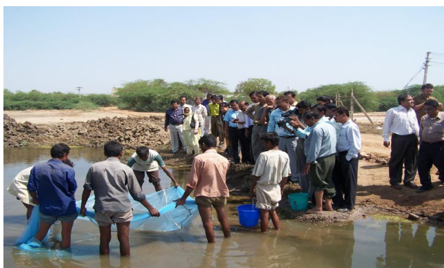
Figure 3: Field demonstration to District Malaria Officers (DMOs) and PHC Medical Officers (MOs) on the occurrence and availability of Aphanis dispar fish in Khambhat, District Anand.

control by providing the necessary trainings on technical aspects, operational issues such as fish identification, collection, transportation, introduction of the fish in all mosquito breeding habitats, precautions during handling and fish density determination etc. Although the use of larvivorous fishes in the malaria control programme has been taken up on operational scale with variable performance levels but large-scale operational use of larvivorous fish for vector control still remains under exploited at the national level and there is an urgent need to set up a national level research and training facility.