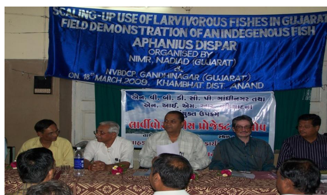
Figure 2: Workshop on scaling up use of larvivorous fishes in collaboration with the Commissionerate of Health, Gujarat, India.