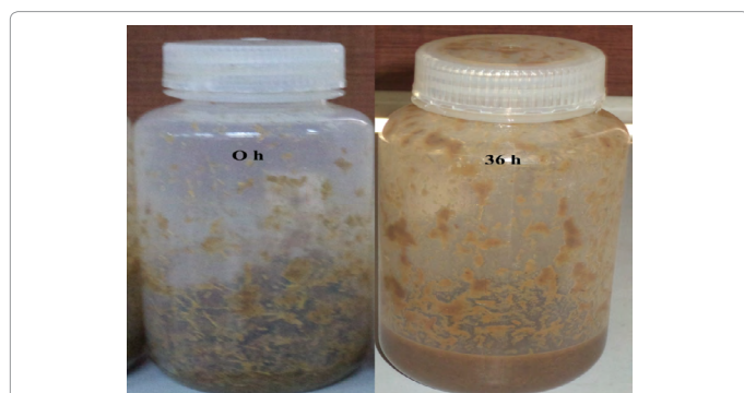
Figure 1: Liquefaction of solid residues at high substrate loading (30%) using developed cocktail of 74.42 U/g crude \beta -xylosidase and 13 FPU/g commercial cellulase at 50°C after 36 h.