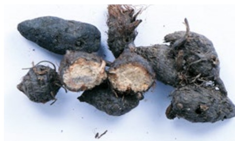
Figure 4: Cyperus rotundus . Numerous pieces of rhizomes ~: with hairs; removed by mechanical scrubbing; thick black tenacious skin (carp); roots; buff white kernel (unique starch – ORIARA's target candidate), bland-yet tasty; tough; energy giving; that hardens with aging, with air/sun drying; not soluble; on long storage disintegrates from within leaving a hulk under the carp. Worm friendly. Very diff., from tapioca or potato starch.

Blood makes bones and bones make blood. Now, the fetus is delivered sans any \text{CaCO}_3 stage bones. Even 2 year post partum such status remains. As the being inhales and exhales air the cartilages oxidize and metamorphose into ' asthi ' i.e., \text{CaCO}_3 is formed (along with blood formation). It is a slow and long process. Therefore, formation of bones is a by-product due the process. Hardening and porosity is sex and age related, respectively. Again, further studies indicated that toxins could be delivered in vivo being directed as organ\cell line specific. Toxins could not be delivered to bones. Even the most virulent endotoxin derived from E.coli 55:5B or the exotoxin Pot. Cyanide do not effect the osteologic frame [9]. This proved that drug delivery routes to the bones were non-existent (mother seems to cut off the route at labor) including toxins like Methotrexate. Therefore, a candidate had to be looked for which could circumvent such natural baffle. Nature observation indicated that worms are bone less. And, they eat and even grow out of the kernel of the nut grass's rhizome ( cyperus ). This, was alike match stick to gun powder. The ketones (Figures 4 and 5) could probably be uptaken swiftly by the muscles and then to the bones via