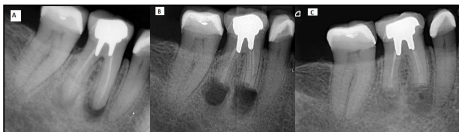
Figure 2. Tooth 46 with apical periodontitis in both roots. Radiographs showing status: (A) preoperative, (B) postoperative and (C) at follow-up revealing complete healing (group 1).

The result of this case series study using Biodentine™ as a root-end seal in an established and well documented periapical surgery procedure, indicates that the material can be used as a retrograde root-end filling. To achieve scientific evidence for the material, prospective studies comparing Biodentine™ to other documented retrograde materials are needed. The radiographic contrast and the preparation procedure of the material have to be improved by the manufacturer.