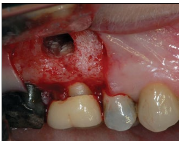
Figure 1. Perioperative situation of tooth 16, with Biodentine™ material in situ.

The surgical procedures were performed by the same surgeon using 4.2 X magnification operating loupes. Local anaesthesia 3.6-5.4 mL, 2% lidocaine with adrenaline was injected into the operating field both as infiltration and/or ID nerve blocks depending on the region. A full-thickness mucoperiosteal buccal flap was raised over the affected tooth. The bony periapical area was exposed using a round-bur followed by removal of the granuloma or cystic lesion from the periapical area. Slightly oblique root-end resection of at least 3 mm with a fissure bur was performed. The root-canal was prepared and cleaned with ultrasonic root-end cavity preparation of 3 mm in depth (Sybron Endo by EMS and diamond coated retrotips). All preparations in the alveolar bone, the apicectomies and the ultrasonic preparation were performed under constant saline irrigation. A small gauze soaked with 1% adrenaline was packed into the bone cavity for 2-3 minutes to achieve haemostasis in the operating field. The canal was then thoroughly dried with 70% alcohol and endodontic paper points. The prepared canals were filled with Biodentine™ (Figure 1) after mixing the powder and liquid for 30 seconds in a triturator. The flap was sutured with Vicryl 4-0 sutures. Two intraoral radiographs were taken immediately after the operation.