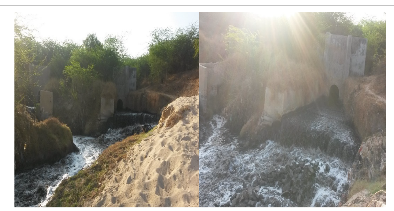
Figure 2: Effluent discharge at mega pipeline.