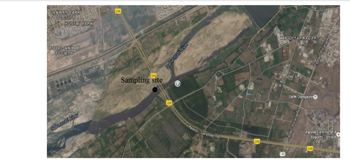
Figure 1: Mega pipeline, Gyaspur village, Ahmedabad.