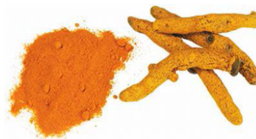
Figure 2b: Curcuma longa rhizome powder.