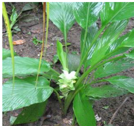
Figure 2a: Curcuma longa plant.

Phytochemical screening of the dye confirmed the presence of saponins, tannins, flavonoids and alkaloids. Among these compounds,