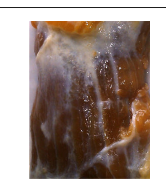
Figure 3: The dorsum aspect of sternocleidomastoid muscle.

In the neck muscles, the dorsum aspect of sternocleidomastoid muscle depicted this finding most frequently (Figure 3). Pneumomediastinum was prominent in midline mediastinal soft tissues (Figure 4).