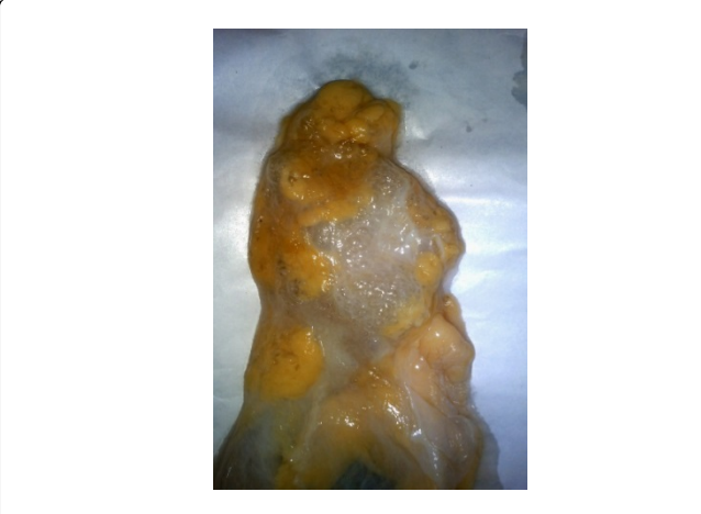
Figure 4: Pneumomediastinum in midline mediastinal soft tissues.

Furthermore the evidence of emphysema could be well appreciated during autopsy from the crackling sound under the dissection knife. The autopsy did not reveal any mucosal lesions of either the upper or lower airways. All the findings were noted and photographed in situ as well as after separating them from their anatomical attachments.